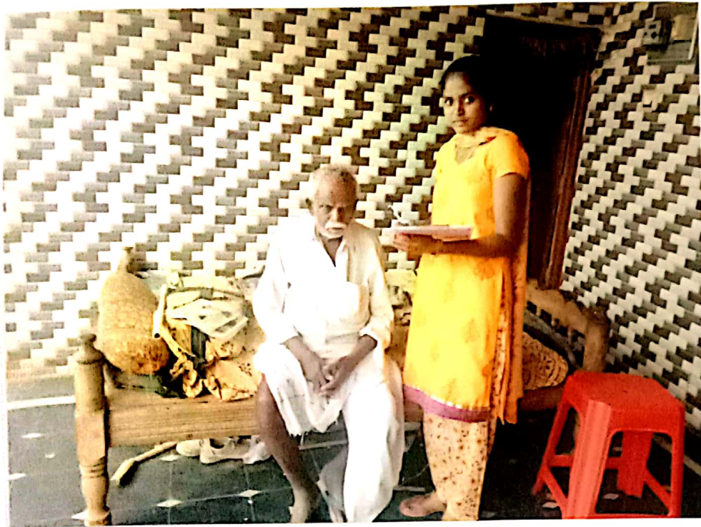
Collecting information from the villages.